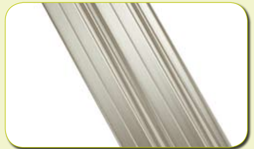
A flat bottom track that is less obtrusive