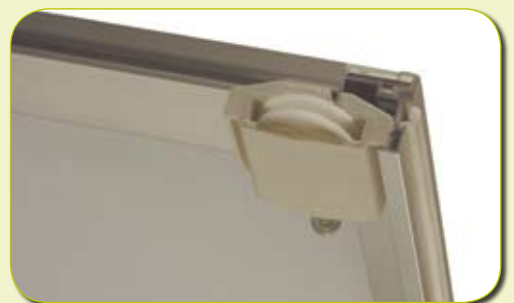
Acetal resin rollers for smooth operation

Contact your mirrorsafe™ dealer for wardrobe options or further information.